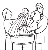
Welcome to Our Family